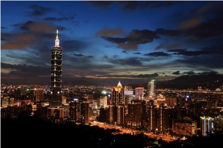
Wonderful night View at XiangShan

Our chauffeur driver will greet you at the airport (TPE) arrival hall, then transfer you to the hotel in central Taipei. Depends on the arrival time, of course you are free to take a rest at hotel, walking around nearby, or we recommend you can spend the night visiting the spectacular XiangShan , in Chinese means elephant mountain. This is one of the best place affording the night view of Taipei 101 along the hiking trail. You will need only within 30 minutes to get to the lookout. For dinner, the most well known traditional food or snacks can be found at night markets ! A big part of Taiwanese culture and foodies will be able to experience local cuisine at reasonable prices from friendly locals. We recommend you taste the unique flavours of their traditional recipes such as Giant Fried Chicken Steak, Tempura, Bubble Tea, Oyster Vermicelli, Oyster Omelet, Fried Buns and of course, the notorious Stinky Tofu.