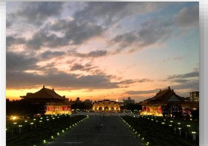
Chiang Kai-Shek Memorial Hall

Or why not pay a visit to the Taipei National Palace Museum : a world-class museum hosts an eclectic collection of artworks and artefacts. It is designed in the style of a Northern Chinese palace that houses nearly 700,000 pieces that span 8,000 years of Chinese history, sharing its roots with the Palace Museum in the Forbidden City in Beijing, as during the Chinese Civil War the collection had to be evacuated to Taiwan to protect it from the risk of destruction. We highly recommend you to visit as it offers the world's most comprehensive collection of ancient Chinese artefacts! *Note: Entrance ticket fee is not included!